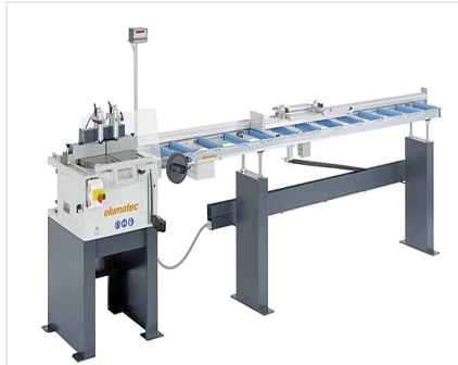
Table saw TS 161/21 + MMS 200