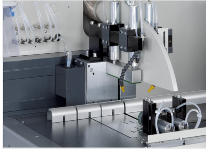
Automatic saw SAS 142/44