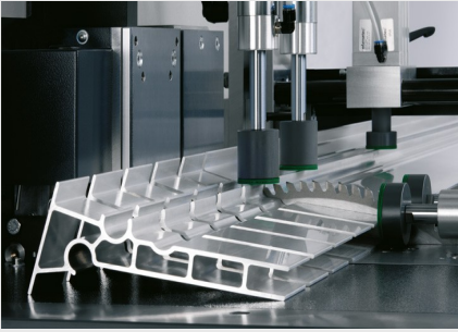
Automatic saw SAS 142/44