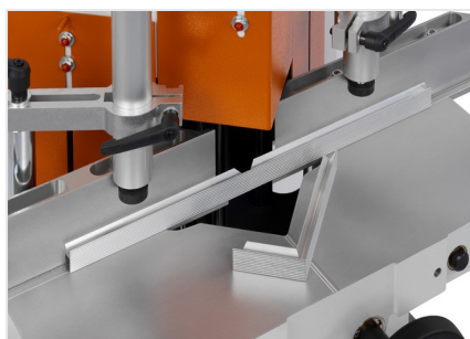
Vee-notch and notching saw KS 101/30