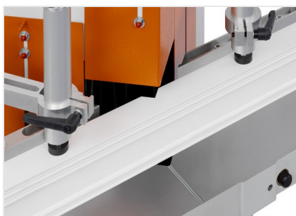
Vee-notch and notching saw KS 101/30