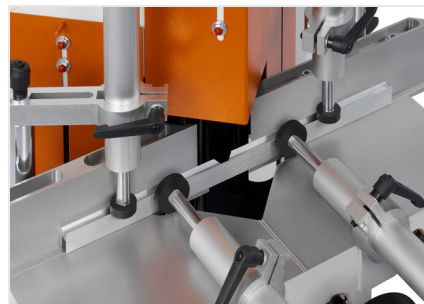
Vee-notch and notching saw KS 101/30