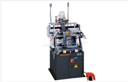
2-spindle copy router KF 78/23