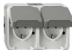
Double two-pin grounded socket

4-fold connection for compressed-air tools