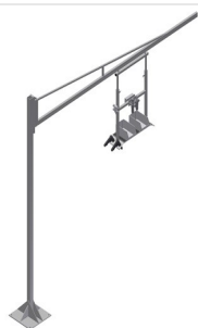
Equipment holder G 3000 + Steel column S 3000