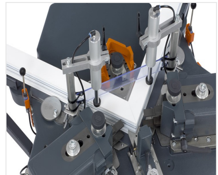
Corner crimper EP 124