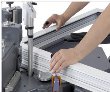
Corner crimper EP 124/20