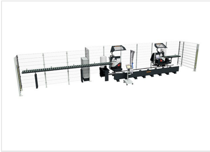
Double mitre saw DG 104 + special accessories