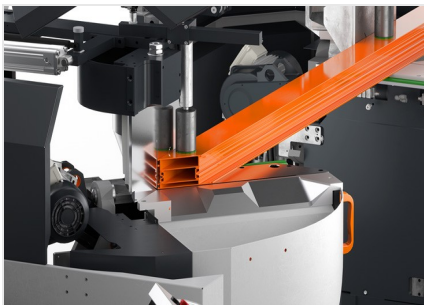
Double mitre saw DG 104