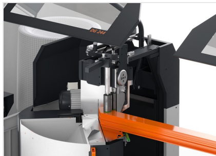
Double mitre saw DG 104 Short stop