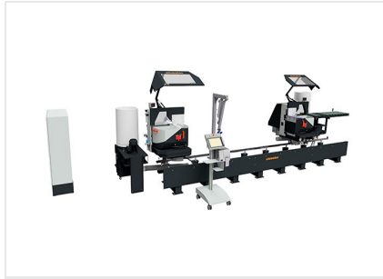
Double mitre saw DG 104 + E 590