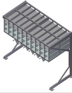
Hardware rack BR 40