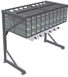
Hardware rack BR 40