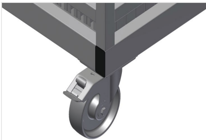
Casters, cmpl. Two casters with brake and two fixed rollers provide mobility in all directions, roller diameter 125 mm