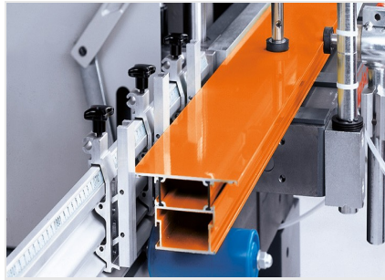
1-spindle copy router AS 170/10