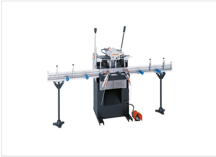
1-spindle copy router AS 170/10