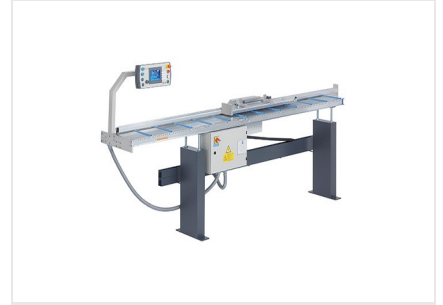
Length stop and measuring system AMS 200 + E 355