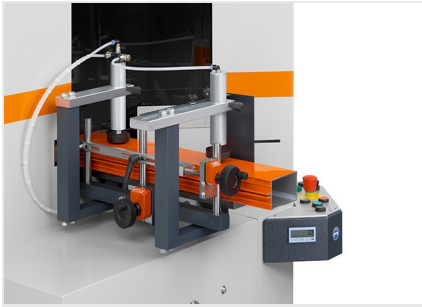
Notching saw AKS V-550