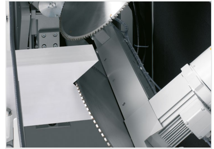
Notching saw AKS 134/64