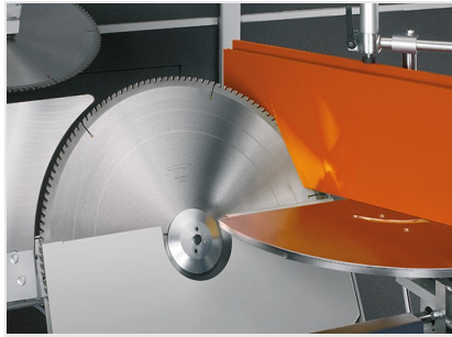
Notching saw AKS 134/64