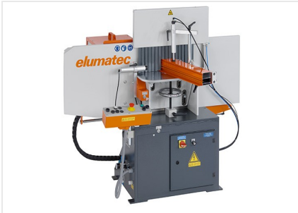
End milling machine AF 223/01