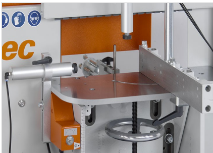
End milling machine AF 223/01