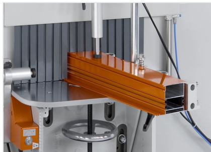
End milling machine AF 223/01