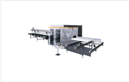
Profile machining centre SBZ 631