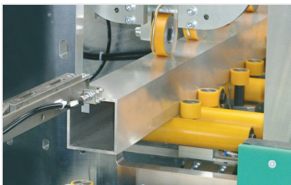
Profile machining centre SBZ 631