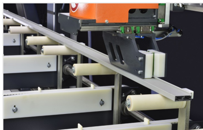
Cut-to-length centre SBZ 616/02