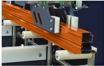
Cut-to-length centre SBZ 616/02