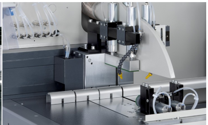
Automatic saw SAS 142/44