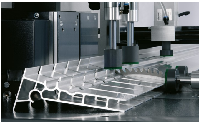
Automatic saw SAS 142/44