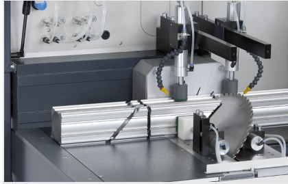
Automatic saw SAS 142/43