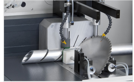
Automatic saw SAS 142/43