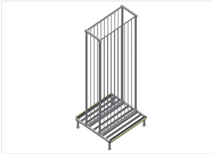
Frame rack RFR 10/01