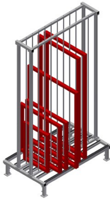
Frame rack RFR 10