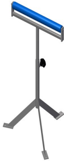
Roller stand MST 1000