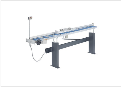
Stop and measurement system MMS 200