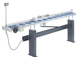
Stop and measurement system MMS 200