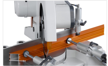
Mitre saw MGS 73/33