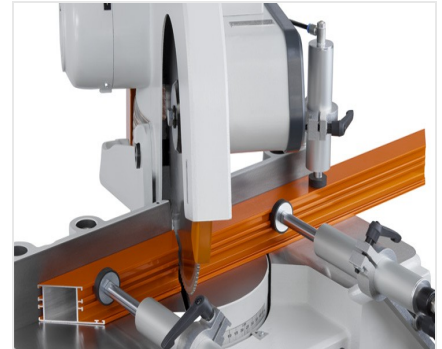
Mitre saw MGS 73/33