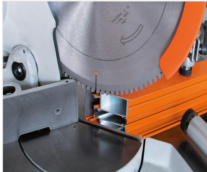
Mitre saw MGS 73/33