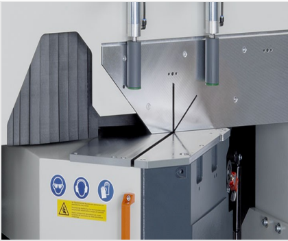
Mitre saw MGS 105