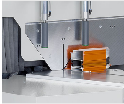
Mitre saw MGS 105