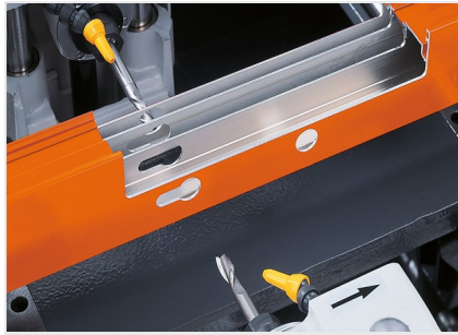
3-spindle copy router KF 178/10