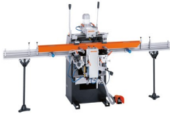
3-spindle copy router KF 178/10