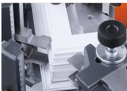
Corner crimper EP 124