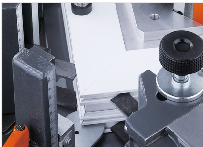
Corner crimper EP 124