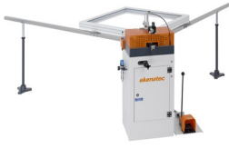
Corner crimper EP 120