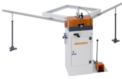
Corner crimper EP 120