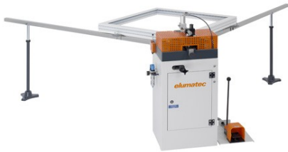
Corner crimper EP 120