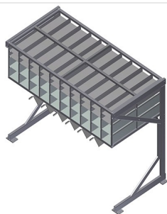
Hardware rack BR 40