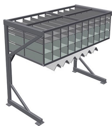
Hardware rack BR 40