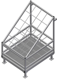
Reinforcement trolley AW 1100