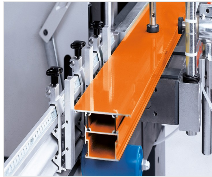
1-spindle copy router AS 170/10