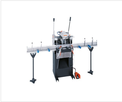
1-spindle copy router AS 170/10