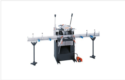
1-spindle copy router AS 170/10