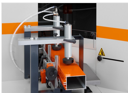
Notching saw AKS V-550