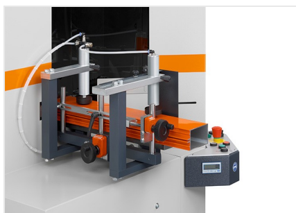
Notching saw AKS V-550