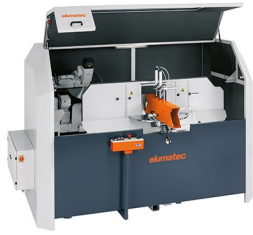
Notching saw AKS 134/64