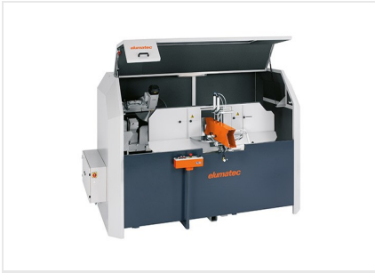
Notching saw AKS 134/64