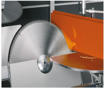
Notching saw AKS 134/64