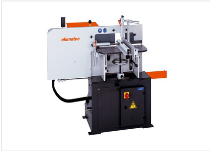
End milling machine AF 222/02