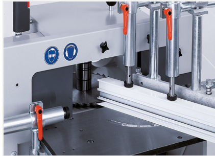
End milling machine AF 222/02